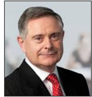
The Minister for Public Expenditure and Reform, Brendan Howlin TD will discuss the Government's vision for HR and Industrial Relations in the public sector

The conference, sponsored by Arthur Cox and Softworks, will be of particular interest for managers, employees and trade unions.