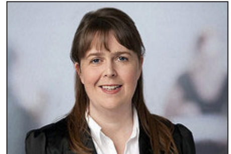
Joanna Tuffy TD is to Chair the new Joint Committee on Education and Social Protection

This time last year, the Government announced that there would be a reduction in the number of committees from 26 to 16; there would be no payment to committee vice-chairs or conveners as existed under the previous Government; Government TDs will be on only one Oireachtas Committee giving them time to focus on the work of that committee; the new committees will be properly resourced, stronger and will bring real focus to the areas they cover. The reforms also saw the establishment of an Investigations, Oversight and Petitions Committee.